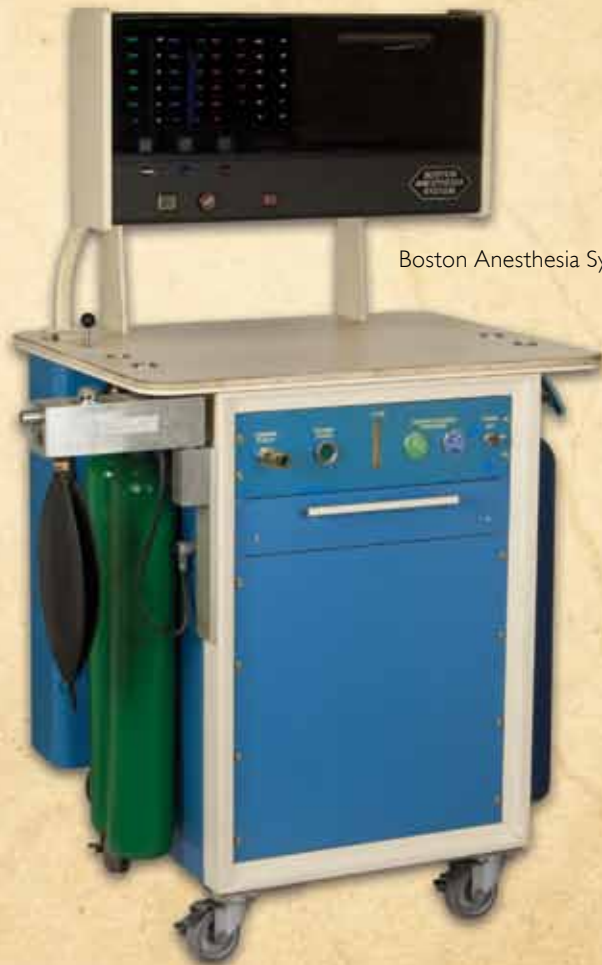
Boston Anesthesia System