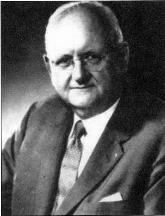
Figure 1. Paul Meyer Wood, M.D.