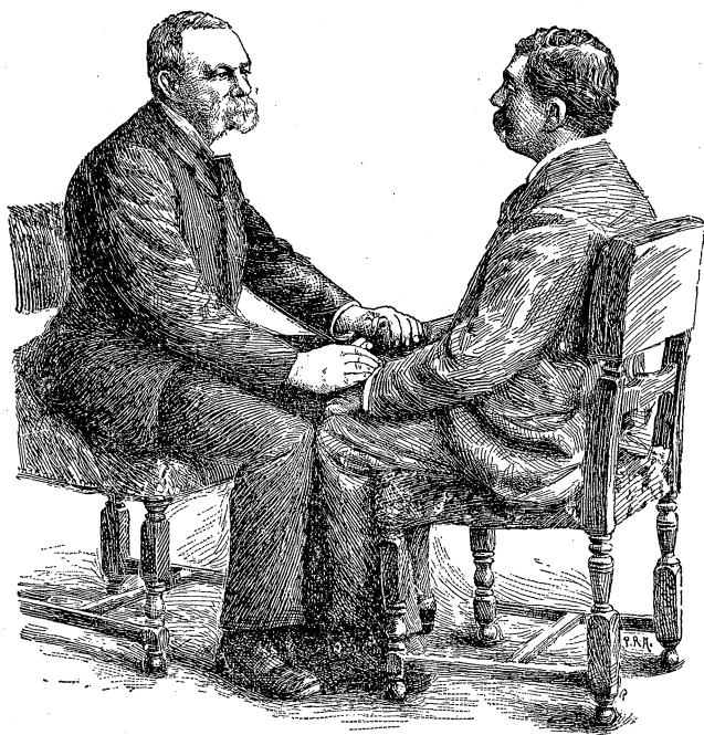
Fig. (3.) The Fascination Method. Original Portraits.