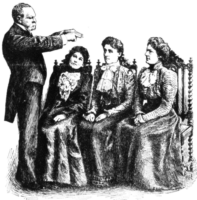
Fig. (5.) The Operator Hypnotising 3 Persons at One Time. Original Portraits.