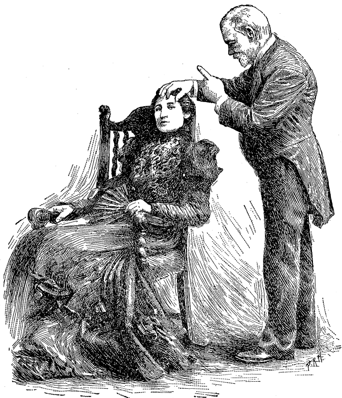
Fig. (4.) Arousing Latent Memories. See Page 158. Original Portraits.