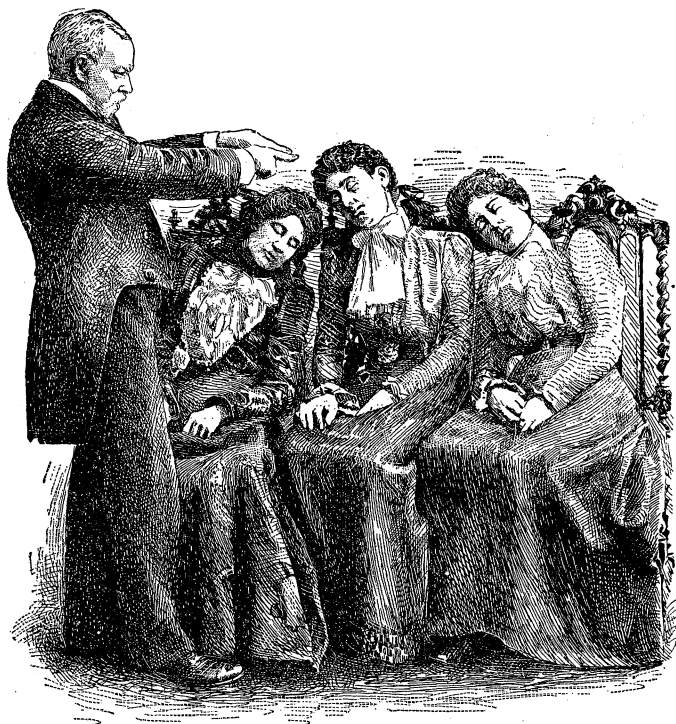
Fig. (6.) Three Persons passing into Hypnotic Sleep. Original Portraits.